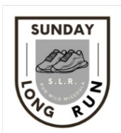
Sunday Long Run *On Pause*