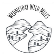
Wednesday Wild Miles