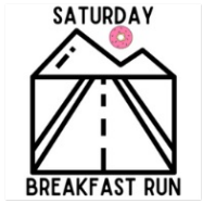
Saturday Breakfast Run